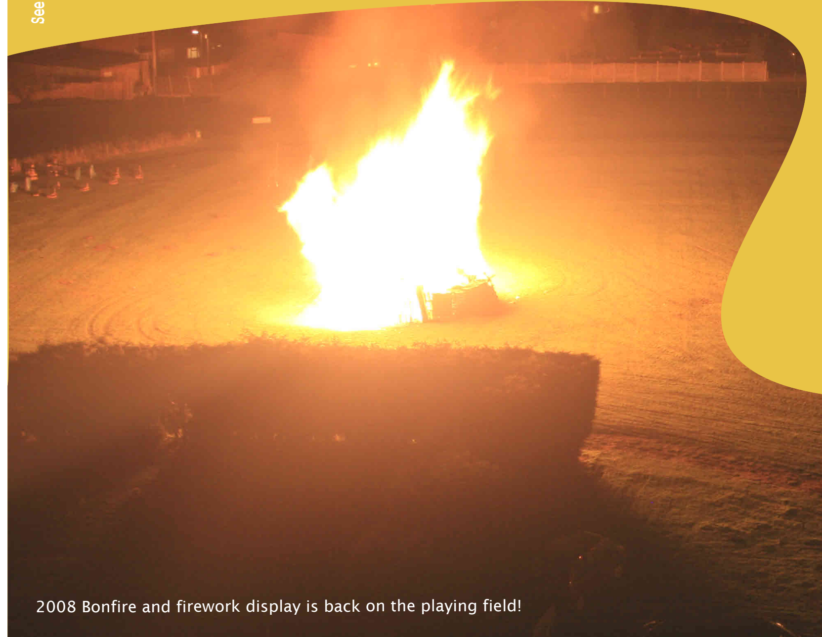
2008 Bonfire and firework display is back on the playing field!

If you can only spare 1hr a week this could help so many.